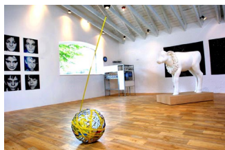
The Glenfiddich Gallery, Art & Authenticity Exhibition

Visitors to the Glenfiddich Distillery this season will have the opportunity to mix with some of Europe's leading contemporary artists as Glenfiddich hosts a unique artists in residence programme.